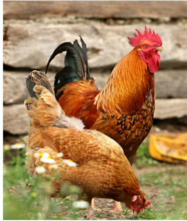
Sustainable Urban Agriculture