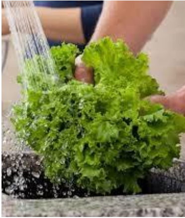
Food and Farm Food Safety

"Linking Citizens of Louisiana with Opportunities for Success"