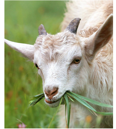
Master Small Ruminant