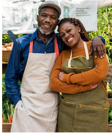
Small Business Development